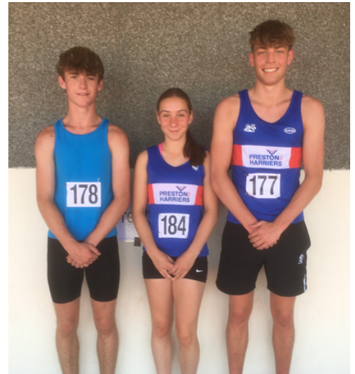
A tremendous achievement by those involved.

Both boys ran an extremely strong race with Will knocking 6 seconds off his previous personal best to achieve 4 minutes 48 seconds, while George ran a very impressive 4 minutes 15 seconds to secure a 3rd place finish and also a new personal best.