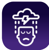
Mental health problems